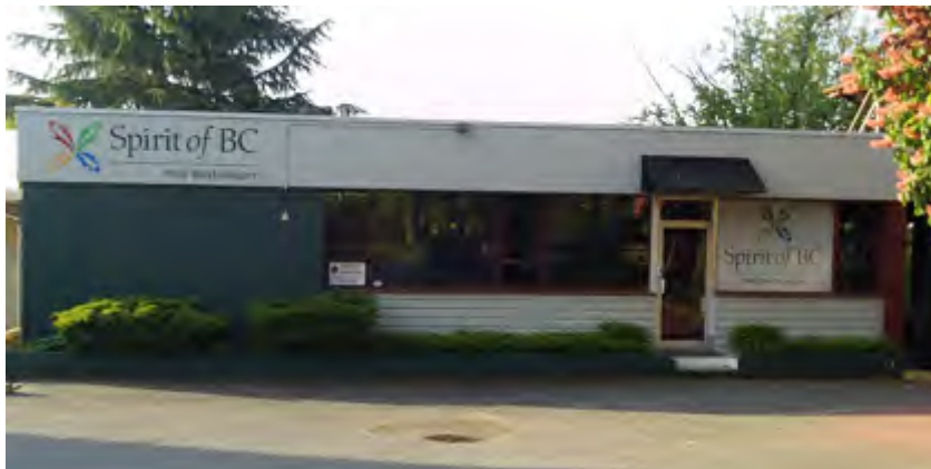
The new premises of the Vancouver Congregation - see below